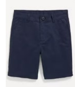
Navy or Khaki Chino Pants or Shorts