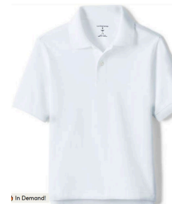
Polo w/ ICA Logo (Long or Short sleeve) Colors: Hunter green, gray, & white