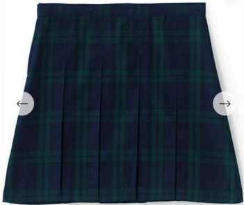
Classic Navy/Evergreen Plaid Skirt