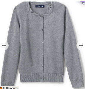
Cardigan sweater (Zip or Buttondown) Colors: Hunter green, gray, navy, & white