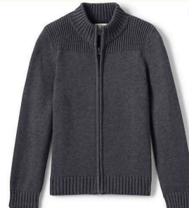
Quarterzip or Fullzip Colors: Gray