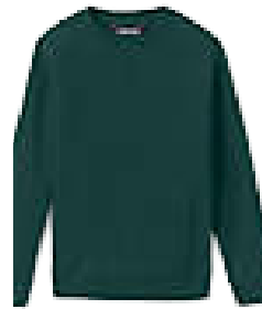
Sweatshirt Colors: Hunter green & gray