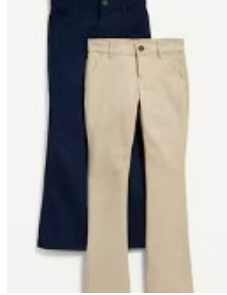
Navy or Khaki Chino Pants or Shorts