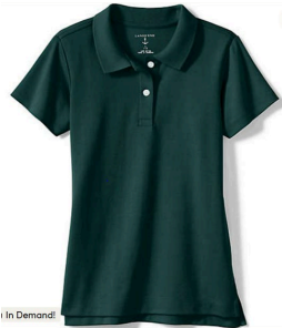
Polo w/ ICA Logo (Long or Short sleeve) Colors: Hunter green, gray, & white