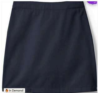
Navy Chino Skirt