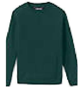
Sweatshirt Colors: Hunter green & gray